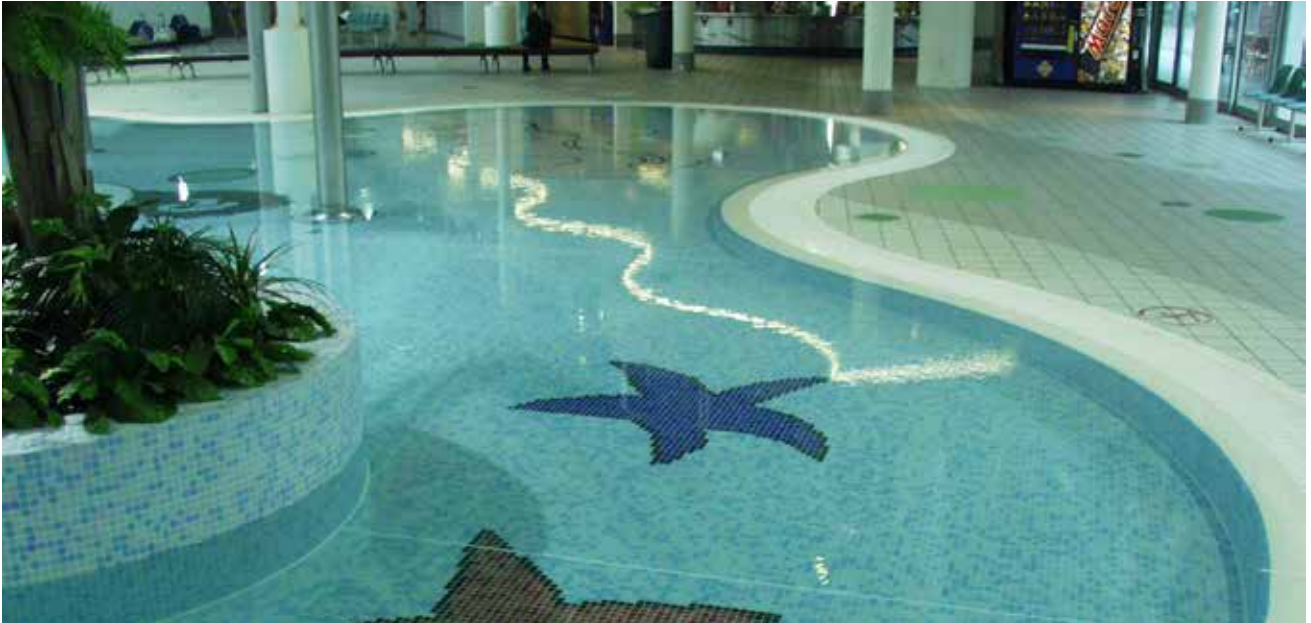
Sydney Aquatic Centre, Sydney, Australia