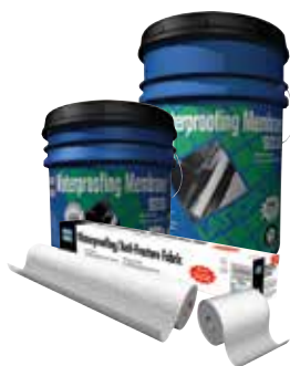
Part of System Warranty Refer to Data Sheet DS-1044