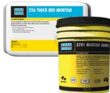
Part of System Warranty Refer to Data Sheets DS-1063 and DS-1046

3701 Fortified Mortar Bed is a one-step polymer fortified blend of carefully selected raw materials, Portland cement and graded aggregates.