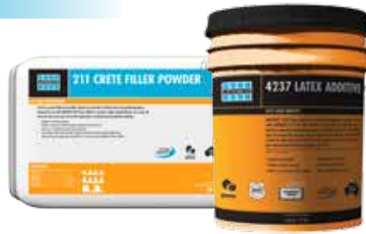
Part of 15 Year Warranty Refer to Data Sheet DS-1064 and DS-1079

A high performance Polymer Fortified adhesive. For the installation of all types of ceramic, porcelain and glass tiles as well as stone using the thin-bed method of installation.