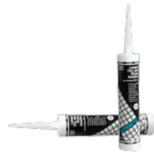
Part of System Warranty Refer to Data Sheet DS-1074