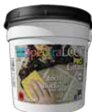
Part of System Warranty Refer to Data Sheet DS-1039