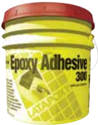
Part of 25 Year Warranty Refer to Data Sheet DS-1047

Designed for use with 211 Powder, 4237 Latex Additive is ideal for installing ceramic tiles, porcelain tiles, and submerged applications.