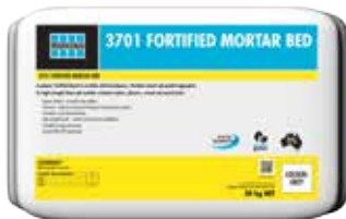
Part of System Warranty Refer to Data Sheet DS-1000