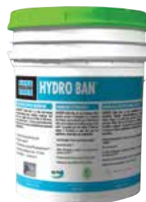
Part of System Warranty Refer to Data Sheet DS-1036

9235 Waterproofing Membrane is "The Industry Standard" for wet areas and continuous water submersion applications.