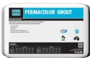
Part of System Warranty Refer to Data Sheet DS-1041