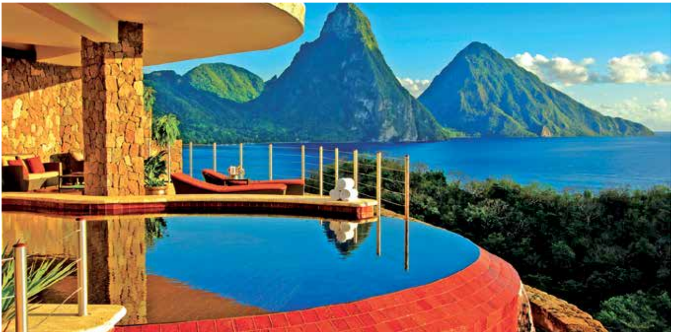
Jade Mountain, Anse Chastenot Resort, Castries, St. Lucia