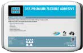
Part of 10 Year Warranty Refer to Data Sheet DS-1037